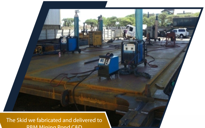
The Skid we fabricated and delivered to RBM Mining Pond C&D