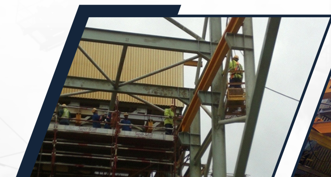
20 Ton Gantry Crane we fabricated and we installed it at RBM (MPC)