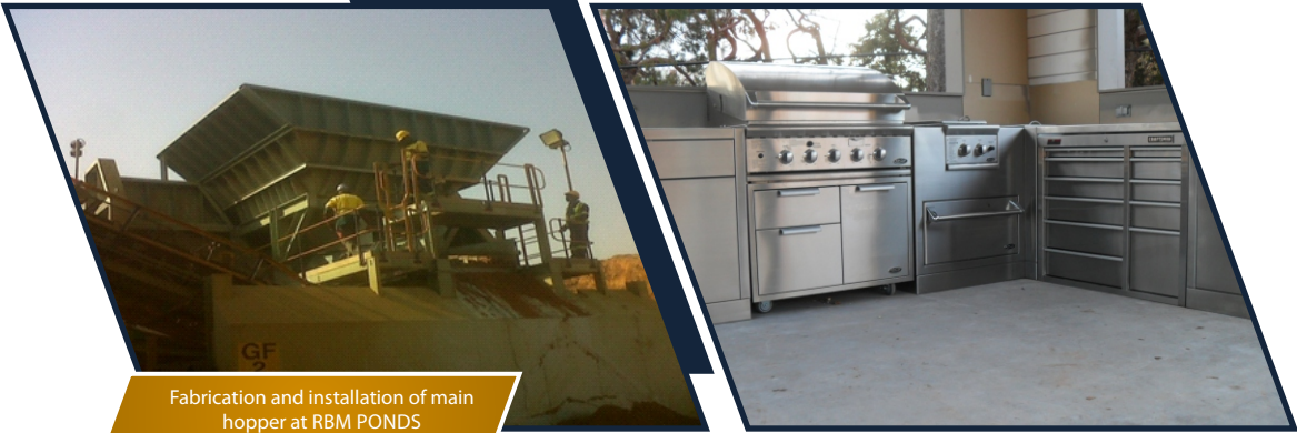
Fabrication and installation of main hopper at RBM PONDS