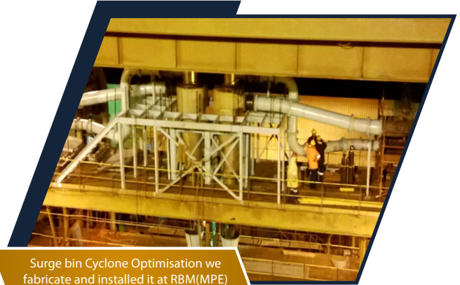
Surge bin Cyclone Optimisation we fabricate and installed it at RBM(MPE)