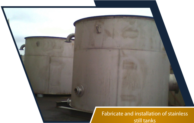
Fabricate and installation of stainless still tanks