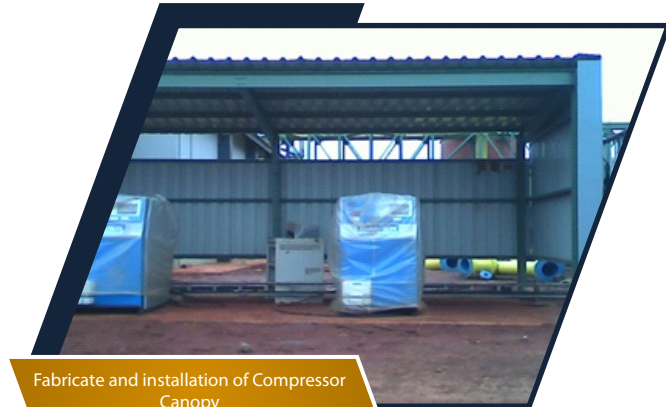
Fabricate and installation of Compressor Canopy