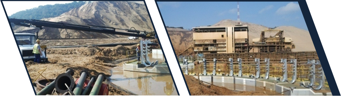
Mmanufacturing and Installation of walkway pontoon and pipes at RBM Mining Pond A, C & E