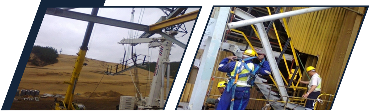
Complete steel steps we fabricated and install it at RBM (MPC)