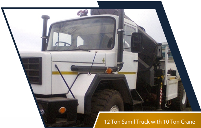
12 Ton Samil Truck with 10 Ton Crane